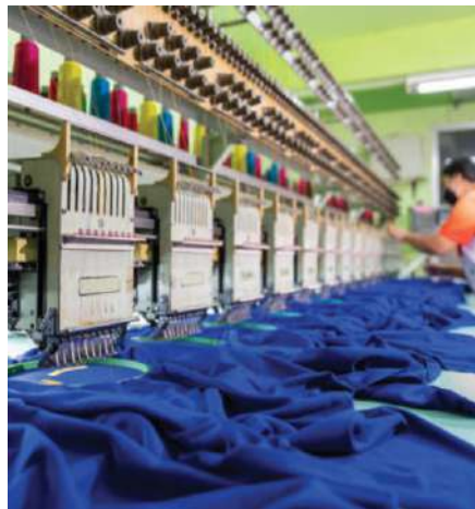
Textile Apparel Park