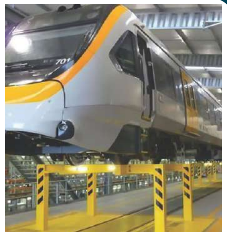
Metro Coach Factory