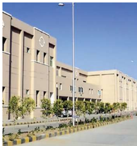
Patanjali Industrial Park