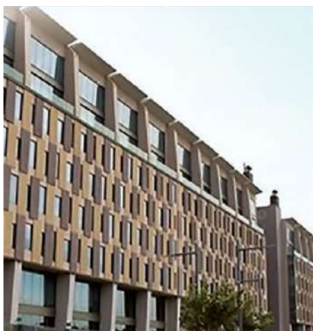
Vivo Industrial Park